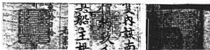
The three seals from the shinpai enlarged

As for the seal, on the day prior to the departure of the Chinese, the relevant person [agent of the interpreters] carried a box in which the aforementioned seal was placed. The key was held by the Administrator. The contents of the shinpai can be read from what was brought to the Administrator by the relevant person. He returned it through his retainer, and the key was given to the relevant person by the retainer. He opened the box before all those present, and soon after showing it to himself he applied the seal. Those present witnessed this, and the retainer gave it to me and asked me to read it. Thus was the extremely rigorous manner in which this matter was handled. I rewrote the text of the seal in regular script and placed it in the box. That way it would not be copied, and at the first opportunity while on duty he would see it in regular script. Beyond this, I do not have a clear recollection. At the time I had occasion to write things from memory. I looked for it for an entire day recently but could not find it. Thus, I cannot respond, but the text of the seal about which you ask in your letter is, without a doubt, the characters from the shinpai .