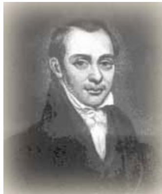
Karl F. A. Gützlaff