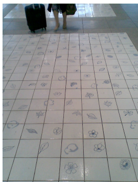
Photo author's own: fieldwork observation: Arita ceramic tiles on the floor of contemporary Hakata station in Japan, a symbolic linkage between Arita and Hakata.

When modern Western technologies and knowledge were incorporated into the East Asian consumer markets, it produced new hybrid cultures that did not entirely imitate those of the original source of influence and are distinguishable with its fusion of new elements into traditional features. The hybrid cultures became autonomous entities with their own existence. I did an approximate physical count of all blue and white porcelains found in the Kyushu Ceramic Museum (KCM) and classified them into several categories based on forms and shapes (tabulated below). The displayed items at the KCM in July 2011 totaled approximately 173 Arita blue and white pieces, not including those integrating other types of glazes. These sometsuke pieces were mainly in the form of lidded vases, bowls, pots, plates, lidded containers, teapots, porcelain stands and vases. There were instances of hybrid pieces where Japanese Arita potters incorporated Western forms and shapes with an Arita porcelain body, tabulated below: