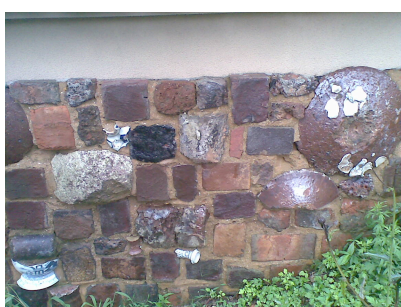
A reconstructed kiln chamber walls by integrating tombai red clay from damaged noborigamas with recycled kiln materials (porcelain stands and saggars)