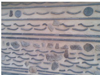
ceramic pieces and roof tiles are embedded into the remnant of the Hakata wall at Shōfukuji Temple built to fend off Mongol invaders from the continental mainland. It is a reminder of the historical trade relations between Hakata and its foreign neighbors.

continually improve, innovate and create new designs. The indigenization process was aided by the fact that Hakata 博多 in Kyushu was an important pre-modern trading metropolis. I carried out textual fieldwork on this subject at the Fukuoka City Museum (FCM) in Momochi 百道 as well as observation studies at the old district of Hakata. My textual collection fieldwork in FCM yielded the publication Chūsei Nihon saidai no bōeki toshi 中世日本最大の貿易都市 by Ōba Kōji 大庭康時 who defined Hakata's renaissance period specifically as chūsei 中世 (defined as AD663-1613 by the same author) 19 when it enjoyed the status of an entrepot trading center for goods moving throughout East Asia, including bilateral trade with China and Korea. My observation fieldwork in the historical Hakata area revealed how continental influences continued to be visible in the old Hakata area. For example, remnant of the Hakata wall built to defend against the Mongol attacks is still visible at the Shōfukuji 聖福寺 Temple. My observation studies at the Fukuoka City Museum also came across stacks of discarded Chinese Jingdezhen Qingbai 青白 wares that were either traded at Hakata, en route to other consumer markets or had defects and were thrown overboard. While the golden age of Hakata trading output is over, the Hakata terminal train station shows how the district remains an important in terms of people movement. The contemporary Hakata station also featured hand-drawn ceramic tiles from Arita.