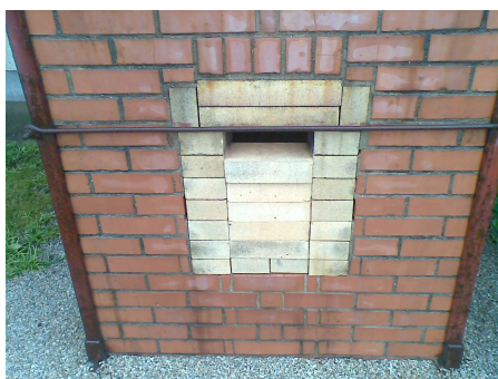
this is a Japanese example of a modern brick kiln. Items are inserted through an opening that is blocked up by bricks. Note the symmetrical and angular kiln structure.

In one of its open-air displays, the Arita porcelain park reconstructed kiln chamber walls by integrating tombai red clay from damaged noborigamas with recycled kiln materials (porcelain stands and saggars) (see photo below). Today, in smaller electric and gas kilns, instead of tombai , insulation blankets, foam, canvas or sponge with even more effective heat-retaining properties line the kiln walls to keep the heat from escaping, saving energy in the process and making firing temperatures more precise.