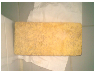
this is an example of the fireproof brick that I acquired in my fieldwork.