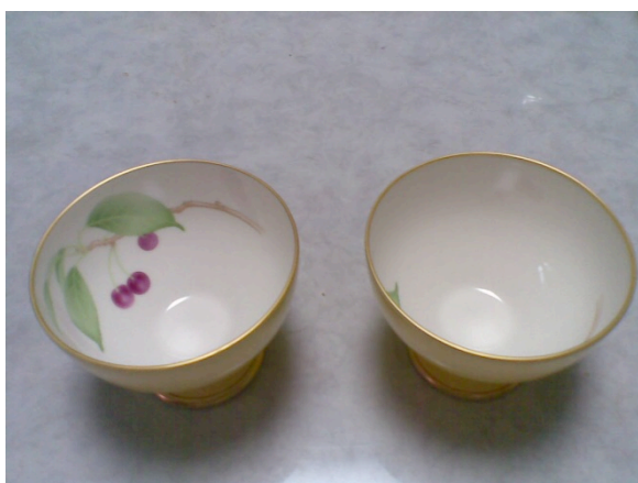
(The photo shows a pair of Western-inspired gold-rimmed Koransha stem-cup wares acquired by the author in Arita.)