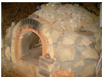
a reconstructed traditional anagama at Izumi City in Kyushu. The body is made of pressed clay, earth, soil, rocks and mortar. The tombai bricks lining the kiln walls are clearly visible at the entrance opening.

Besides noborigama , anagama 穴窯 is another pre-modern timber-fired kiln that I encountered in my fieldwork in Japan. Anagamas have a tunnel design instead of a beehive shape but worked on the same principle of leading hot air draft through a tunnel kiln and up a chimney. Both anagama and noborigama that I encountered in my fieldwork had the commonality of having its interiors lined with red clay or bricks. They help to retain the heat from the firing process inside the chamber for energy efficiency. I came across a specially-reconstructed anagama kiln in Izumi City where the owner used fireproof bricks to line the kiln walls to retain heat within the firing chamber. Red clay called tombais were used to line the walls of noborigamas that can withstand 1300 degrees Celsius or more and after firing, wood ash adhere to these clay materials. The label 'red' is a generic description as the clay color comes in a variety of red, yellowish and orange tones, for example, the brick that I collected in my fieldwork is closer to yellowish in color (refer to photo below). Tombai units can be in the form of unsymmetrical stone-shaped pieces or uniformly-shaped brick units. I came across a tombai wall artifact in my fieldwork observation at the Arita porcelain park (photo appended later in the section below).